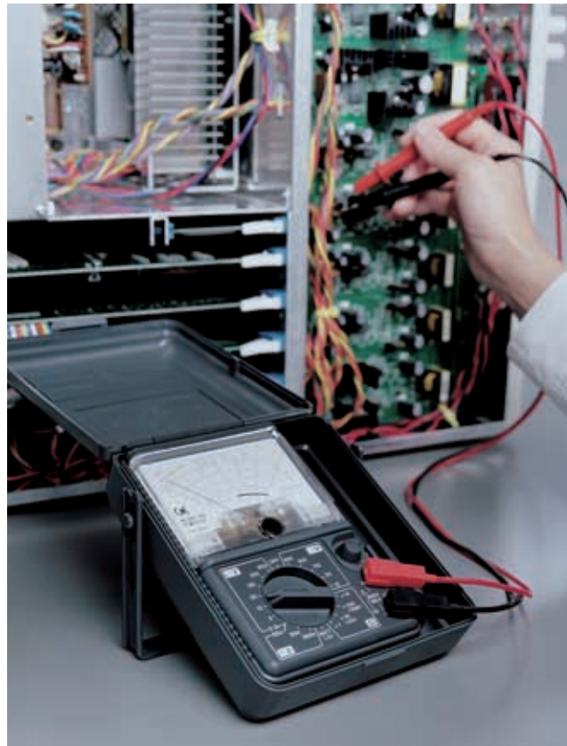
Carrying handle of the supplied case becomes a stand.